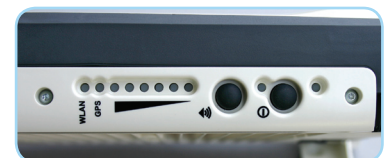
Front view, close-up